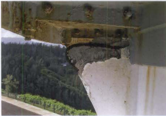
Figure 12. The concrete lighthouse at the Kilauea Point Light Station, Kilauea, Kauai, Hawaii, was constructed circa 1913. The concrete, which was a good quality, high strength mix for its day, is in good condition after almost one hundred years in service. Deterioration in the form of spalling related to corrosion of embedded reinforcing steel has occurred primarily in areas of higher ornamentation such as projecting bands and brackets (see close-up photo).

the concrete tends to be weak and porous because these aggregates absorb water. Some of these aggregates can be extremely susceptible to deterioration when exposed to moisture and cyclic freezing and thawing. Concrete was sometimes compromised by inclusion of seawater or beach sand that was not thoroughly washed with fresh water, a condition more common with coastal fortifications built prior to 1900. The sodium chloride present in seawater and beach sand accelerates the rate of corrosion of the reinforced concrete.