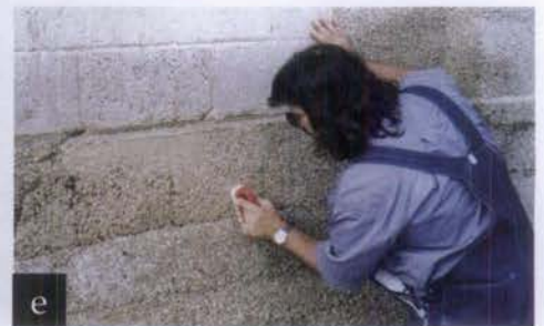
Figure 17. (a) The 63rd Street Beach House was constructed on the shoreline of Chicago in 1919. The highly exposed aggregate concrete of the exterior walls of the beach house was used for many buildings in the Chicago parks as an alternative to more expensive stone construction. (b) Concrete deterioration included cracking, spalling, and delamination caused by corrosion of embedded reinforcing steel and concrete damage due to cyclic freezing and thawing. (c) Various sizes and types of aggregates were reviewed for matching to the original concrete materials. (d) Mock-ups of the concrete repair mix were prepared for comparison to the original concrete. Considerations included aggregate type and size, cement color, proportions, aggregate exposure, and surface finish. (e) The craftsman finished the surface to replicate the original appearance in a mock-up on the structure. Here, he used a nylon bristle brush to remove loose paste and expose the aggregate, creating a variable surface to match the adjacent original concrete.

Where used for crack repairs on historic facades, the finished appearance of the sealant application must be considered, as it may be visually intrusive. In some cases, sand can be broadcast onto the surface of the sealant to help conceal the repair.