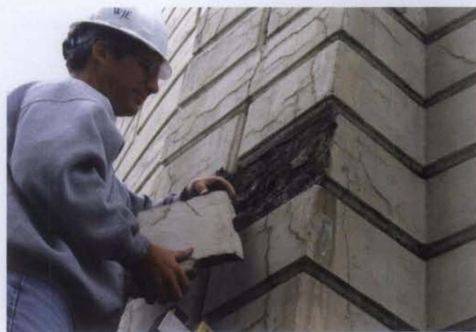
Figures 14. Layers of architectural concrete that have debonded (spalled) from the surface were removed from a historic water tank during the investigation performed to assess existing conditions.

phenomena when water-rich cement paste (laitance) rises to the surface. The resulting weak material is vulnerable to spalling of thin layers, or scaling. In some cases, spalling of the concrete can diminish the load-carrying capacity of the structure.