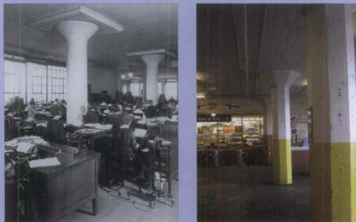
Figure 11. Whether in a circa 1925 office (left) or in a parking garage and retail facility (right), exposed concrete structures help characterize these building interiors. Photo: Minnesota Historical Society (left).

The historic character of a building's interior can also be conveyed in a more utilitarian manner in terms of concrete features and finishes (Fig. 11). The exposed concrete structure—columns, capitals, and drop panels—is an integral part of the character of this old commercial building in Minneapolis. In concrete warehouse and factory buildings of the early twentieth century, exposed concrete columns and formboard finish concrete slab ceilings are common features as seen in this warehouse, now converted for use as a parking garage and shops.