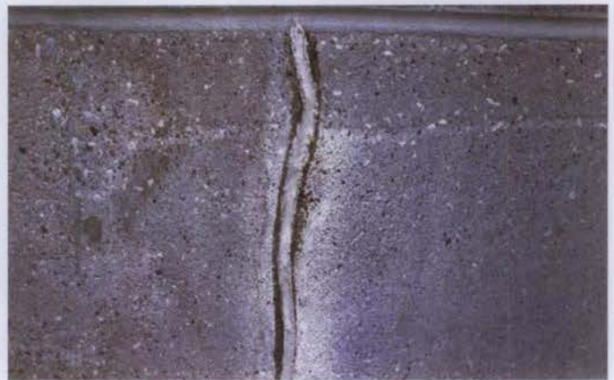
Figure 19. A high-speed grinder is used to widen a crack in preparation for installation of a sealant. This process is called "routing." After the crack is prepared, the sealant is installed to prevent moisture infiltration through the crack. Although sealant repairs can provide a durable, watertight repair for moving cracks, they tend to be very visible.

due to original construction techniques, architectural design, or differential exposure to weather. Trial repairs and mock-ups are used to evaluate the proposed replacement concrete work and to refine construction techniques (Fig 20).