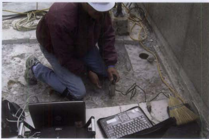
Figure 16. Impact echo testing is performed on a concrete structural slab to help determine depth of deterioration. In this method, a short pulse of energy is introduced into the structure and a transducer mounted on the impacted surface of the structure receives the reflected input waves or echoes. These waves are analyzed to help identify flaws and deterioration within the concrete.

Sealants are an important part of maintenance of historic concrete structures. Elastomeric sealants, which have replaced traditional oil-resin based caulks for many applications, are used to seal cracks and joints to keep out moisture and reduce air infiltration. Sealants are commonly used at windows and door perimeters, at interfaces between concrete and other materials, and at attachments to or through walls or roofs, such as with lamps, signs, or exterior plumbing fixtures.