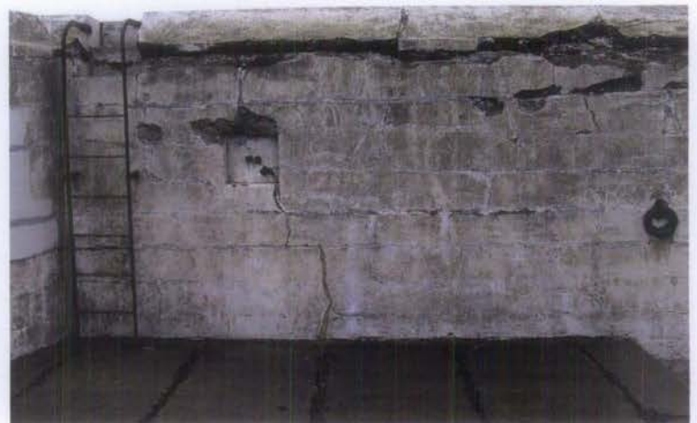
Figure 13. Fort Casey on Admiralty Head, Fort Casey, Washington, was constructed in 1898. The lift lines from placement of concrete are clearly visible on the exterior walls and characterize the finished appearance.

In the early twentieth century, concrete was sometimes placed in several layers parallel to the exterior surface. A base concrete was first created with formwork and then a more cement rich mortar layer was applied to the exposed vertical face of the