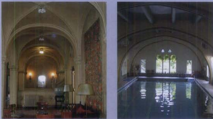
Figure 10. The Berkeley City Club has significant interior spaces and features of concrete construction, including the lobby and pool.

The expanded use of concrete provided new opportunities to create dramatic spaces and ornate architectural detail on the interiors of buildings, at a significant cost savings over traditional construction practices. The architectural design of the Berkeley City Club in Berkeley, California, expressed Moorish and Gothic elements in concrete on the interior of the building (Fig. 10). Used as a woman's social club, the building was designed by noted California architect Julia Morgan and constructed in 1929. The vaulted ceilings, columns, and ornamental capitals of the lobby and the ornamental arches and beamed ceiling of the "plunge" are all constructed of concrete.