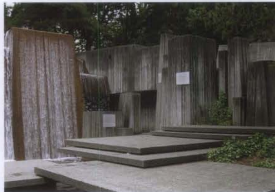
Figure 9. The Ira C. Keller Fountain in Portland, Oregon, was designed by Lawrence Halprin and constructed in 1969. The fountain is constructed primarily of concrete pillars with formboard textures and surrounding elements, patterned with geometric lines, which facilitate the path of water.