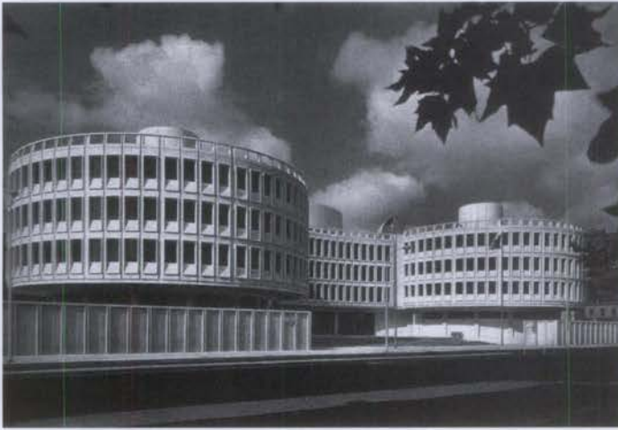
Figure 5. Following World War II, architects and engineers took advantage of improvements in concrete production, quality control, and advances in precast concrete to design structures such as the Police Headquarters building in Philadelphia, Pennsylvania, constructed in 1961.

Highway as an example. Concrete “seedling miles” were constructed in remote areas to emphasize the superiority of concrete over unimproved dirt. The Association believed that as people learned about concrete, they would press the government to construct good roads throughout their states. Americans’ enthusiasm for good roads led to the involvement of the federal government in road-building and the creation of numbered U.S. routes in the 1920s (Fig. 3).