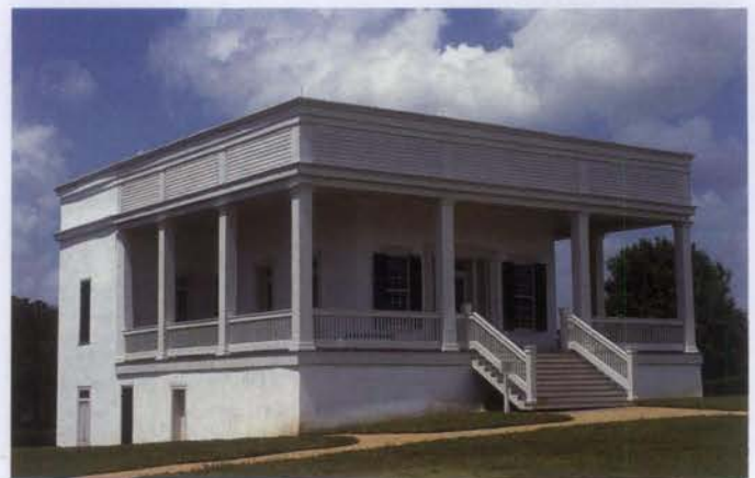
Figure 1. The Sebastopol House in Seguin, Texas, is an 1856 Greek Revival-style house constructed of lime concrete. Lime concrete or “limecrete” was a popular construction material, as it could be made inexpensively from local materials. By 1900, the town had approximately ninety limecrete structures, twenty of which remain.

The Erie Canal in New York is an example of the early use of concrete in transportation in the United States. The natural hydraulic cement used in the canal construction was processed from a deposit of limestone found in 1818 near Chittenango, southeast of Syracuse. The use of concrete in residential construction was