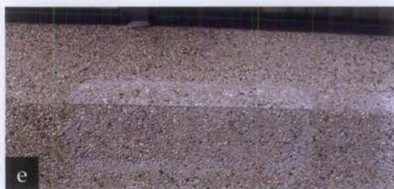
Figure 18. (a) Exposed aggregate precast concrete is sounded with a hammer to detect areas of deterioration. Corrosion of the exposed reinforcing steel bar has led to spalling of the adjacent concrete. (b) Samples of aggregate considered for use in repair concrete are compared to the original concrete materials in terms of size, color, texture, and reflectance. (c) Various sample panels are made using the selected concrete repair mix design for comparison to the original concrete on the building, and the mix design is adjusted based on review of the samples. (d) After removal of the spall, the concrete surface is prepared for installation of a formed patch. (e) Prior to placement of the concrete, a retarding agent is brush-applied to the inside face of the formwork to slow curing at the surface. After the concrete is partially cured, the forms are removed and the surface of the concrete is rubbed to remove some of the paste and expose the aggregate to match the original concrete.

to cement ratio. Some admixtures, including polymer modifiers, may change the appearance of the concrete mix. Design of the concrete patching material should address characteristics required for durability, workability, strength gain, compressive strength, and other performance attributes. During installation of the repair, skilled workmanship is required to ensure proper mixing procedures, placement, consolidation, and curing.