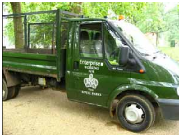
Maintenance contractors brand trucks to capture the park's brand, The Royal Parks.