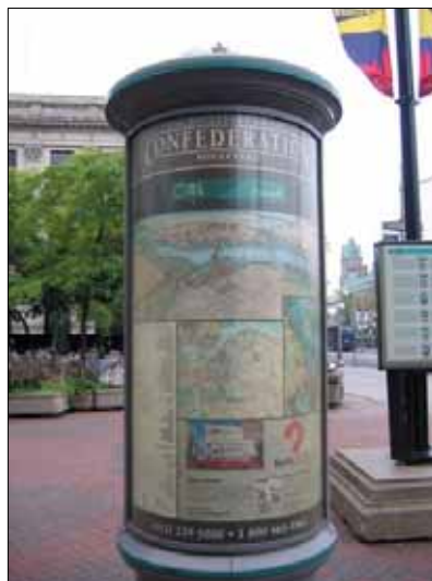
Quality is reflected in the design of orientation and information signs at the parks in Ottawa.