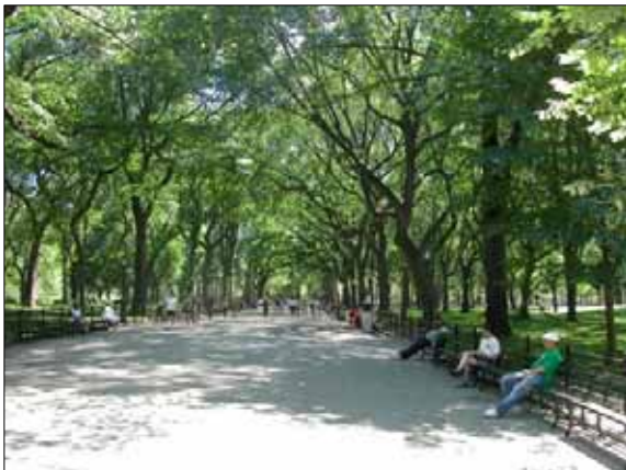
Literary Walk, Central Park, New York

Landownership: New York City Parks Department