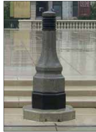
Standardized utility hookups can be disguised in bollards, reducing the need for temporary facilities. Shown are utility hookups in Ottawa (left and center) and a utility bollard in Chicago's Millennium Park (right).