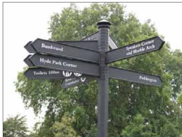
Directional signage with universal symbols in The Royal Parks.