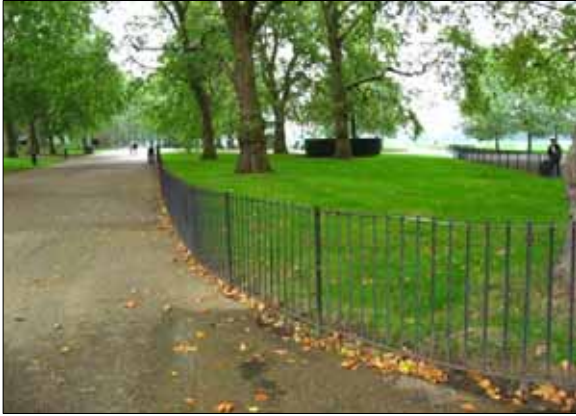
Various styles of fencing protect the landscape. The Royal Parks in London (top and middle left, bottom right), Central Park in New York City (bottom left), and Ottawa (below).