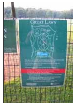
The red flag system used in Central Park alerts visitors to area closures for maintenance.