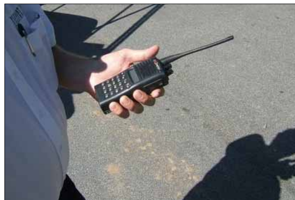
Handheld communication device used in Atlanta's Piedmont Park.