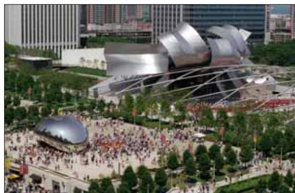
Opening weekend 2004, Millennium Park, Chicago.

Size and Facilities: The park includes the Jay Pritzker Pavilion, with its 2.5-acre Great Lawn (an outdoor concert area with lawn seating capacity of 11,000 and pavilion seating of 4,000), the Lurie Garden, Cloud Gate/SBC