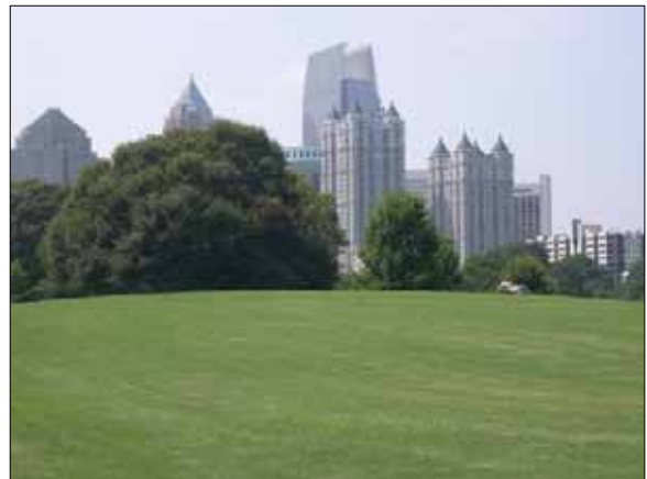
Oak Hill, Piedmont Park, Atlanta.