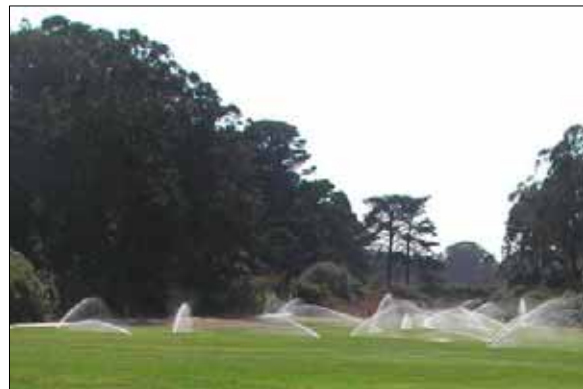
Irrigation in San Francisco's Golden Gate Park.