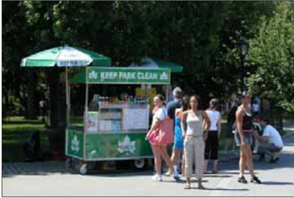
Vendor cart in New York's Central Park promotes "clean and green" messaging.