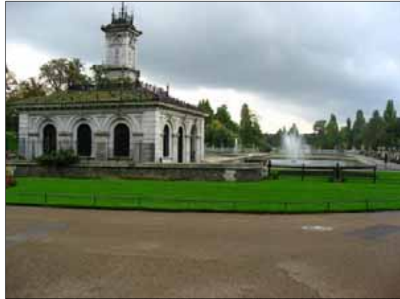
The Royal Parks, London, England

tion, and to consolidate our role nationally and internationally at the forefront of park management