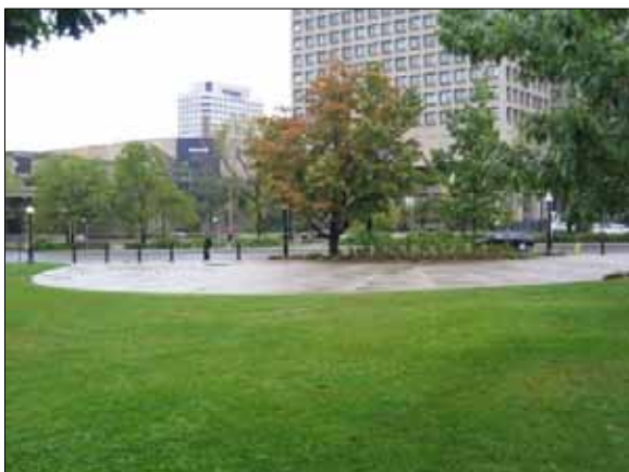
Event hardscape can be attractively designed, as at Confederation Park in Ottawa.

pressure off other sites used for events. For example, the turf design is based on golf course design, the irrigation system gets water from the adjacent museum's cooling tower, utility hookups are embedded in site furnishings, and hardscape is available for staging.