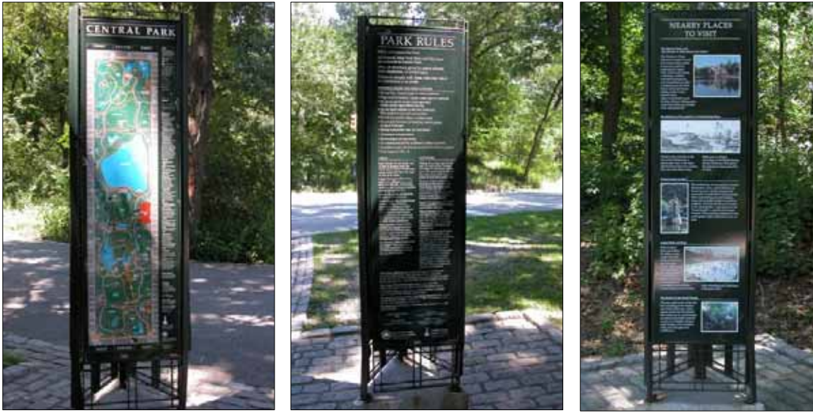
Signs provide interpretive information, park rules, and a detailed map in New York's Central Park.