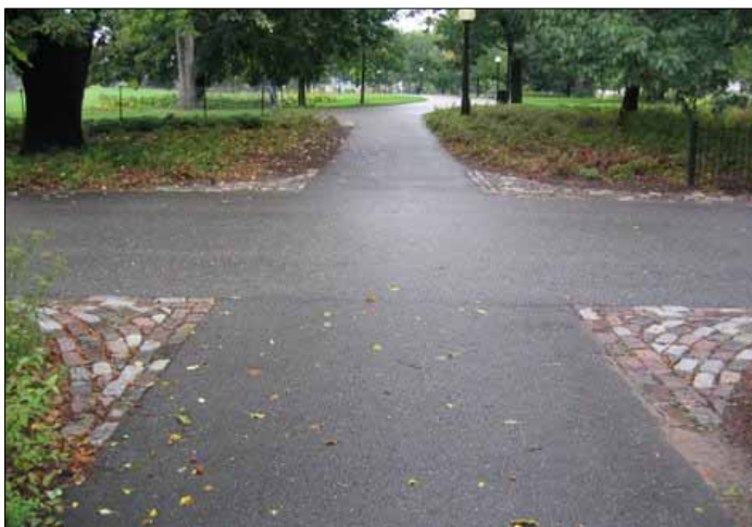
Landscape damage at corners in Ottawa has been mitigated with cobblestones and other durable materials.