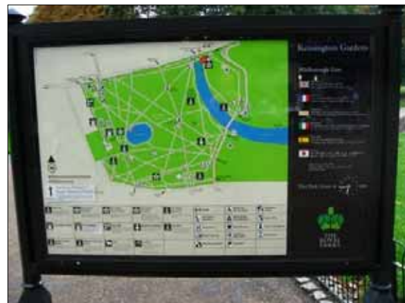
Signs in The Royal Parks provide detailed information and orientation.