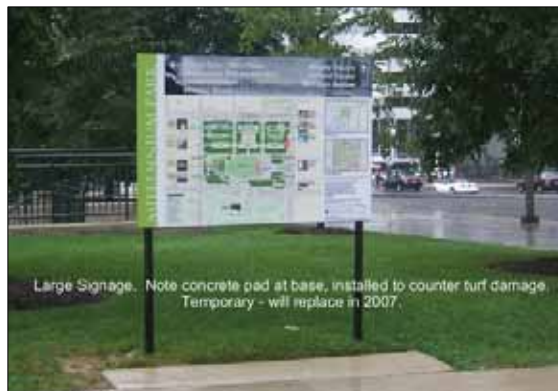
Hard surfacing adjacent to visitor stopping places prevents wear and tear on turf. Examples are from Ottawa (top left), Central Park in New York City (top right), and Millennium Park in Chicago (left).