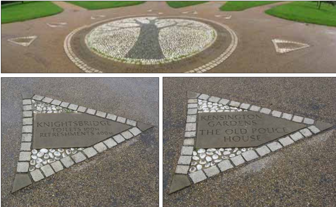
Innovative orientation and information signs in London's Royal Parks.

Coordinating signage with other parks, museums, and visitor attractions reduces visitor confusion. Highly visible signs should provide information and orientation for both pedestrians and vehicle passengers. Visitors are often unaware or less concerned with management and jurisdictional boundaries than are the responsible agencies and organizations. Partnerships that promote a seamless visitor experience among complementary visitor attractions enhance visitors' experiences.