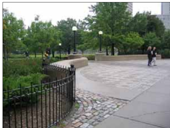
Park entrance controls circulation at Confederation Park in Ottawa.

Site surveys revealed that asphalt or similar materials are most prevalent and preferred in terms of ease of maintenance and durability. In Chicago the Lakefront Path is a 10-foot-wide bike and in-line skating path with 3 feet of gravel path on either side for runners and walkers. Rather than battle the social paths that inevitably develop beside asphalt pedestrian paths, the running section is gravel, which is preferred by runners and high-impact walkers.