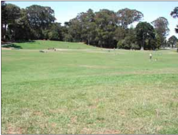
Golden Gate Park, San Francisco.

The remaining acreage consists of roadways, buildings, and specialized recreation areas.