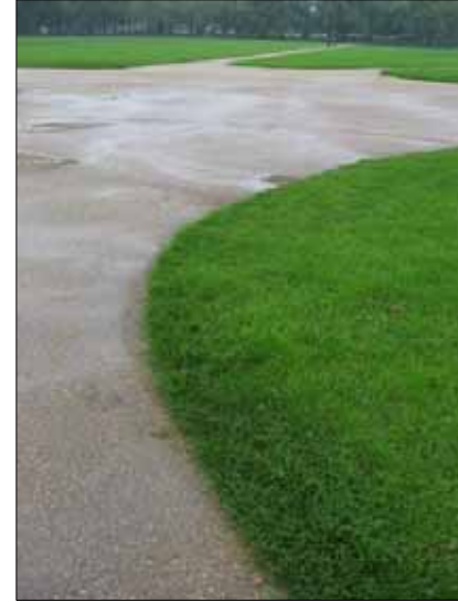
Curved pathways eliminate erosion at corners in London's Royal Parks.