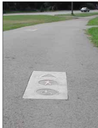
Examples of trails designed and marked for various uses. The Royal Parks at the top, Golden Gate Park at the bottom.