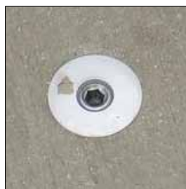
Snack bar tent anchored to hardscape and anchors for tents found throughout the Promenades in Millennium Park.