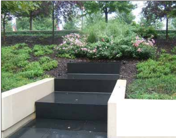
Plants atop seats (designed with appearance similar to steps) thwart a developing social trail in Millennium Park in Chicago.

Circulation and access challenges should be considered from a historical point of view, and important historical characteristics should not be eliminated in order to address present-day problems. In Central Park the Mall and Literary Walk are formal elements of the original design. The park acknowledged the public's need for a place to socialize; they knew that a "grand promenade" was an "essential feature of a metropolitan park." Flanking the 40-foot-wide Mall are quadruple rows of American elms (see the photo on page 2). The elms and surrounding turf are permanently fenced off, with pedestrian traffic contained on the walkway and seating provided on benches that follow the fencing.