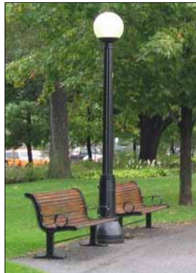
Bench styles sitting on hard surfaces protect turf. The Royal Parks (left top and bottom), Piedmont Park in Atlanta (top right), and Ottawa (bottom right).

surrounding design elements — cobblestones, pavers, asphalt, etc. As was the case at some study sites, the need to place site furnishings and signs on hard surfaces often becomes apparent after damage has been done to the surrounding landscape.