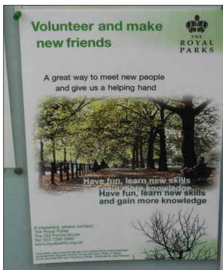
An advertisement for volunteers at The Royal Parks.

Piedmont Park has strong support from volunteers. For example, a Cleaning Green activity is held every Saturday, which attracts over 2,000 volunteers per year, and off-duty law enforcement officers regularly volunteer for park patrols. Community support is paramount; even outside contractors supply their excess mulch to Piedmont Park.