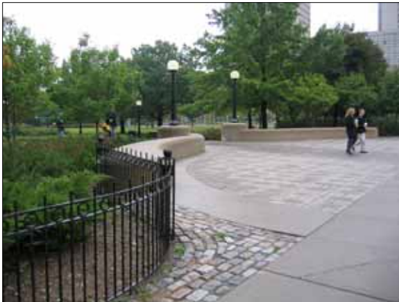
Confederation Park, Ottawa, Canada

Use: Most of the major events occur due to traditions — celebration of an important day (e.g., July 1st) or an event that has been ongoing for years or decades (e.g., the Tulip Festival), rather than by any type of governmental or free speech mandate. Regardless of the history of an event, all events are subject to a rigorous planning and management process.