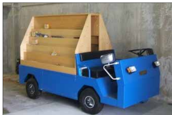
Mobile welcome center in Chicago's Millennium Park.

Golden Gate Park in San Francisco represents the classic in-house model for maintenance operations. Seventy full-time employees provide coverage seven days a week. On weekdays staff is on duty from 4 a.m. until midnight.