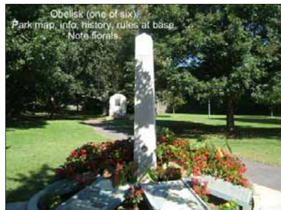
Piedmont Park in Atlanta provides information and orientation in a designed setting.