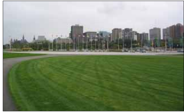
The Commons, Ottawa's new event space, is designed to accommodate large-scale use.